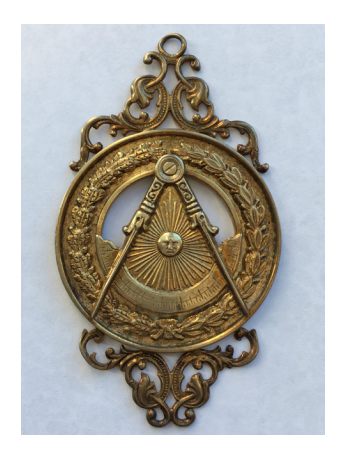
Jewel and Emblem Grand Master