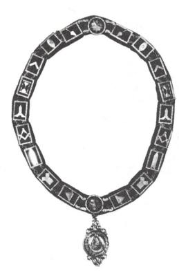
Collar Grand Master