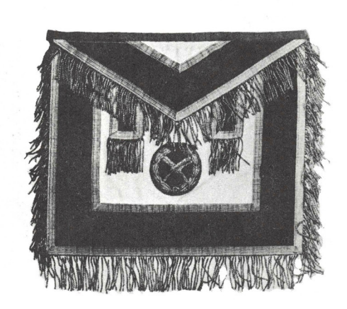
Apron Grand Secretary