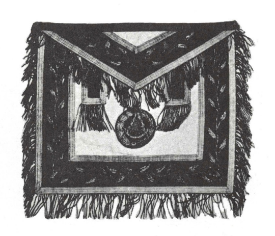
Apron Past Grand Master