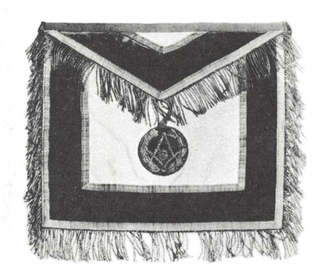
Apron Senior Grand Deacon