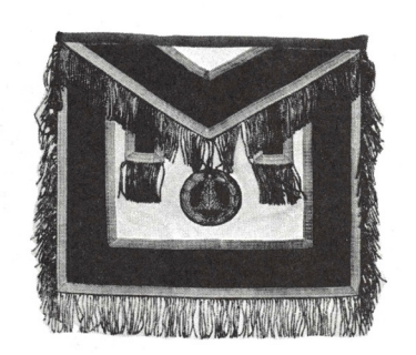
Apron Senior Grand Warden