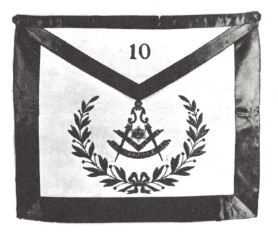
Apron District Deputy Grand Master