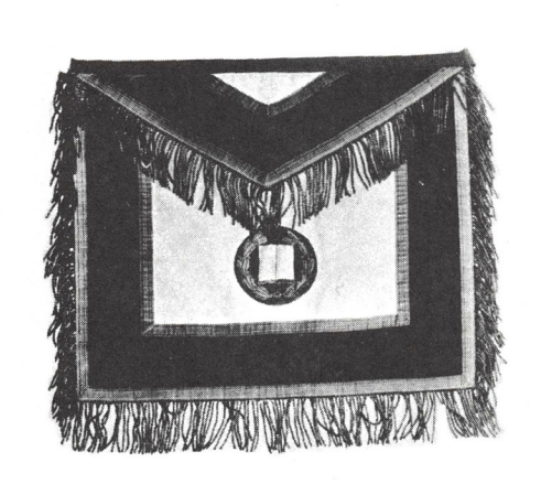
Apron Grand Chaplain