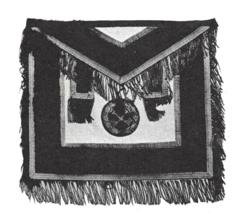
Apron Grand Treasurer