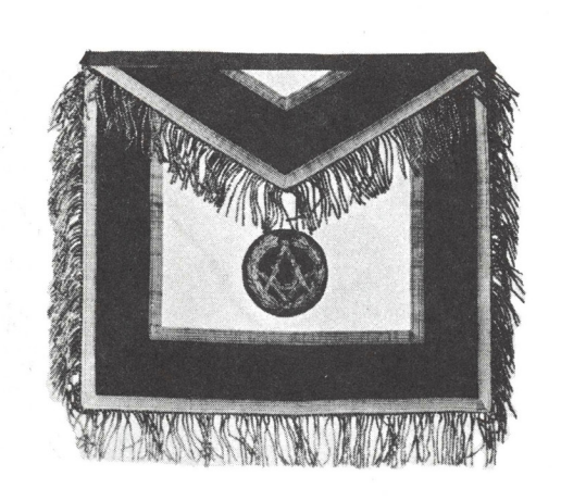
Apron Junior Grand Deacon