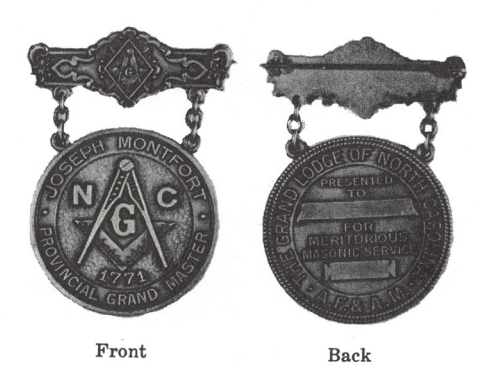
Joseph Montfort Medal