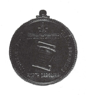
Jewel and Emblem District Deputy Grand Lecturer