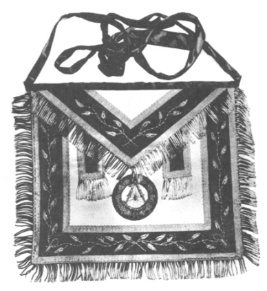
Apron Grand Master