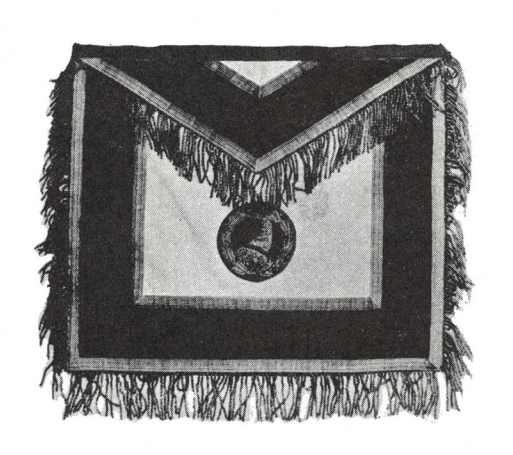
Apron Grand Steward