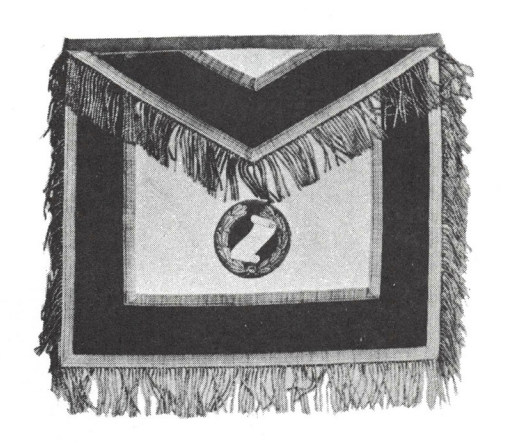
Apron Grand Lecturer