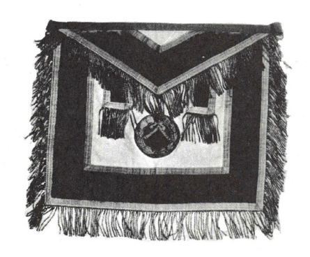
Apron Deputy Grand Master