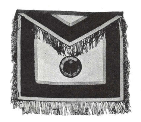
Apron Grand Tyler