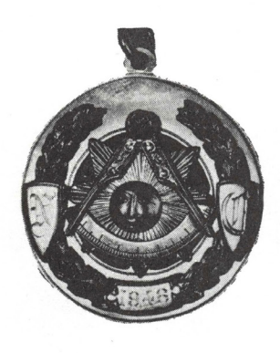
Jewel and Emblem Past Grand Master