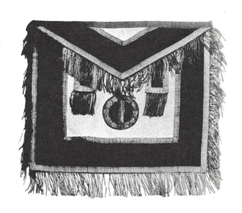
Apron Junior Grand Warden