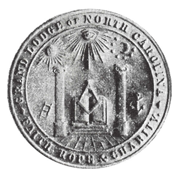
Seal of the Grand Lodge of North Carolina