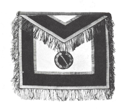
Apron Grand Marshal