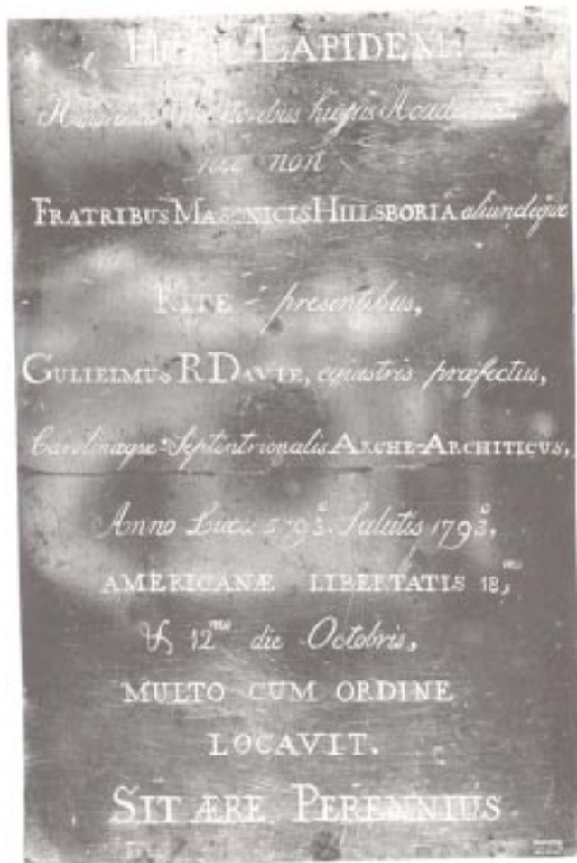
Old East Cornerstone Plate. Latin side of cornerstone plate for "Old East" gives in Latin same text as appears on the opposite side in English. See preceding picture.