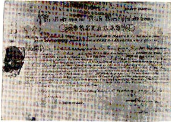
1795 New Bern Charter. After a long battle to secure recognition as the oldest or second oldest lodge in N.C., St. John's gave in during 1795 and accepted its third rank, confirmed in this charter of January 26, 1795.