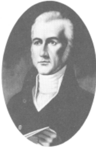
William R. Davie. Grand Master of N.C. Masons, 1792-1799, hero of the Revolutionary War, "father" of the University of N.C., Governor of N.C. 1798-1799.

magnificent war-record as a former cavalry colonel in the North Carolina Line, a wounded veteran of the Battle of Stono Ferry and other key engagements. 3 He had been a delegate to the Constitutional Convention in Philadelphia in 1787 when he was one of the warmest and most out-spoken advocates of the Federal Constitution. He had also represented the borough of Halifax since 1786 in the state legislature where he proved his mettle as a political tactician and a statesman. 4