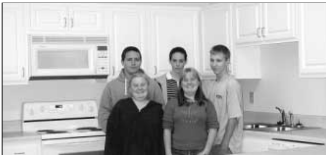
Several residents of our Home for Children take a look at the kitchen, top, of one of the new cottages nearing completion, above.