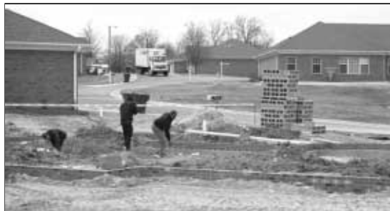
"It's so nice to know that I'll never have to rake leaves, mow the lawn, or shovel snow again" — A new resident of the Masonic and Eastern Star Retirement Village

Under this new admission plan NO assets are assigned to the Masonic and Eastern Star Home. An approved applicant pays an entrance fee for a new house (1,700 square-feet, two bedrooms, two baths, kitchen, dining room, living room, entry